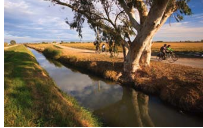
2 End of the Senyora's way

After 1.2 km we turn left, taking a bridge over the L'Anglès irrigation channel. We go along for 100 m and turn right along a dirt track, parallel to a drainage channel, which we follow for 2.4 km—along this stretch we have a splendid view of the Serra del Montsià—to the TV-3406 road from La Ràpita to Sant Jaume d'Enveja. We cross the road very carefully and go straight ahead for 500 m, where we find the path that takes us left and after another 400 m. meets up with the L'Encanyissada cycle path (km 10.5).