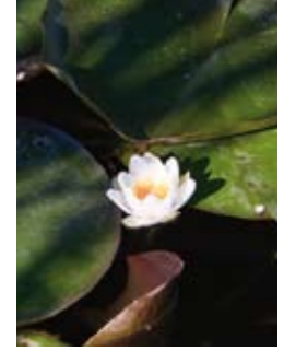
European white waterlily