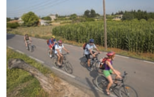
2 L'Aldea-Lligallo. Orchards.

We continue and after 300m come to a roundabout. We go straight ahead towards l'Ampolla on the Roquer road, from which we can see the deltaic plain, as we are just on (and above) the old coastline.