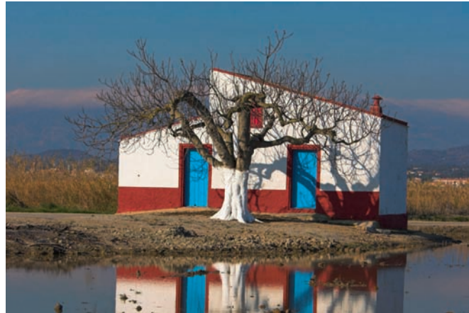
8 Paddy field hut