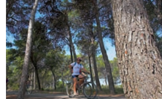
3 Pinets de Camarles

At the end of the Roquer road, we have to negotiate a steep downhill section and then find the sign heading us towards l'Ampolla ( Km 10.2 ).