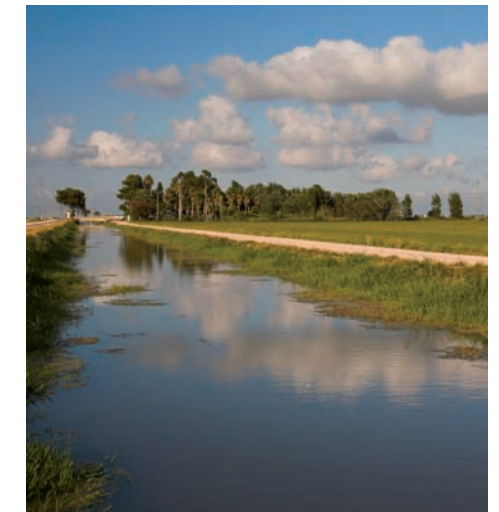
9 Main sewer