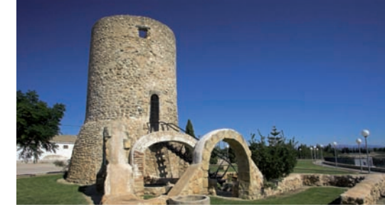
5 Camarles Tower