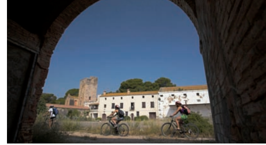
4 La Granadella Tower

From Les Olles Pond we travel towards the seaside village of l'Ampolla, to the railway station 2.7 km away, to return by train to l'Aldea (l'Aldea station is 3.8 km from the hermitage). Timetable information: 902 240 202 (travelling with a bicycle on the train is legal and free of charge).