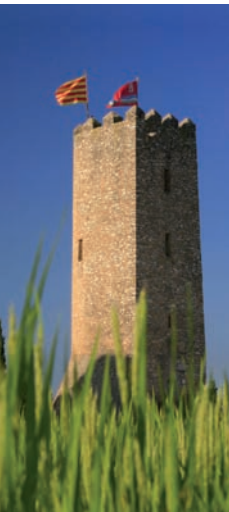
1 L'Aldea tower