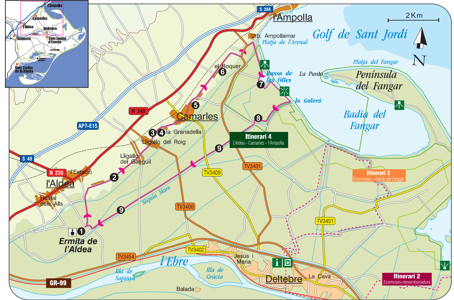
6 Lo Roquer