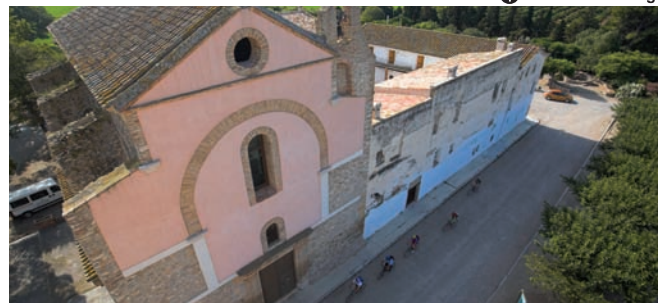
1 L'Aldea Hermitage